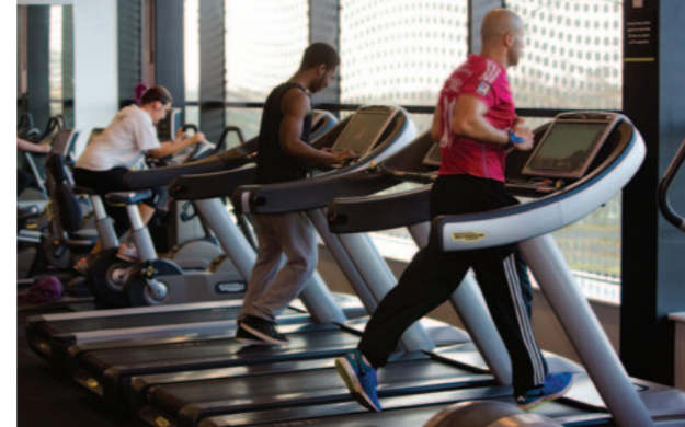
100 station fitness suite