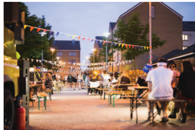
Summer Extrav celebrations