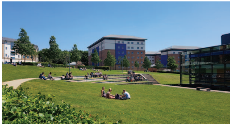
The Bonington Step

For more information, please visit lancaster.ac.uk