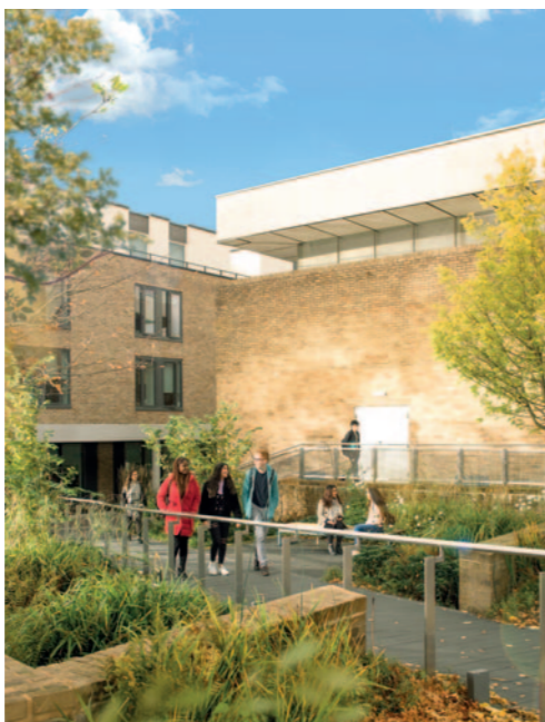
Great Hall Court

"The wildlife living around the accommodation is so special. It's nice to look out a window and see a rabbit, squirrel or a duck. They make great neighbours!"