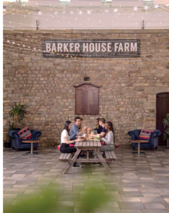
Barker House Farm