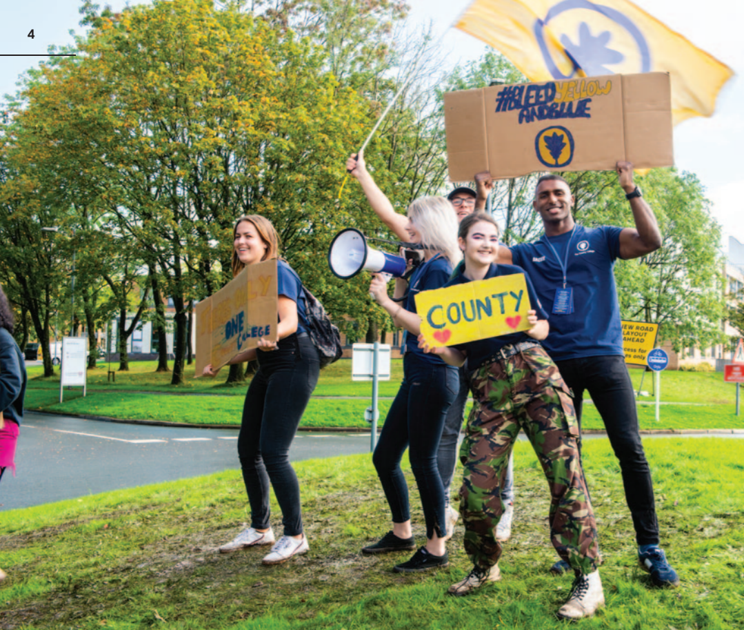
Moving in weekend

"From my first day here, the college has supported me in feeling at home, and supported me in getting the most out of my time here."