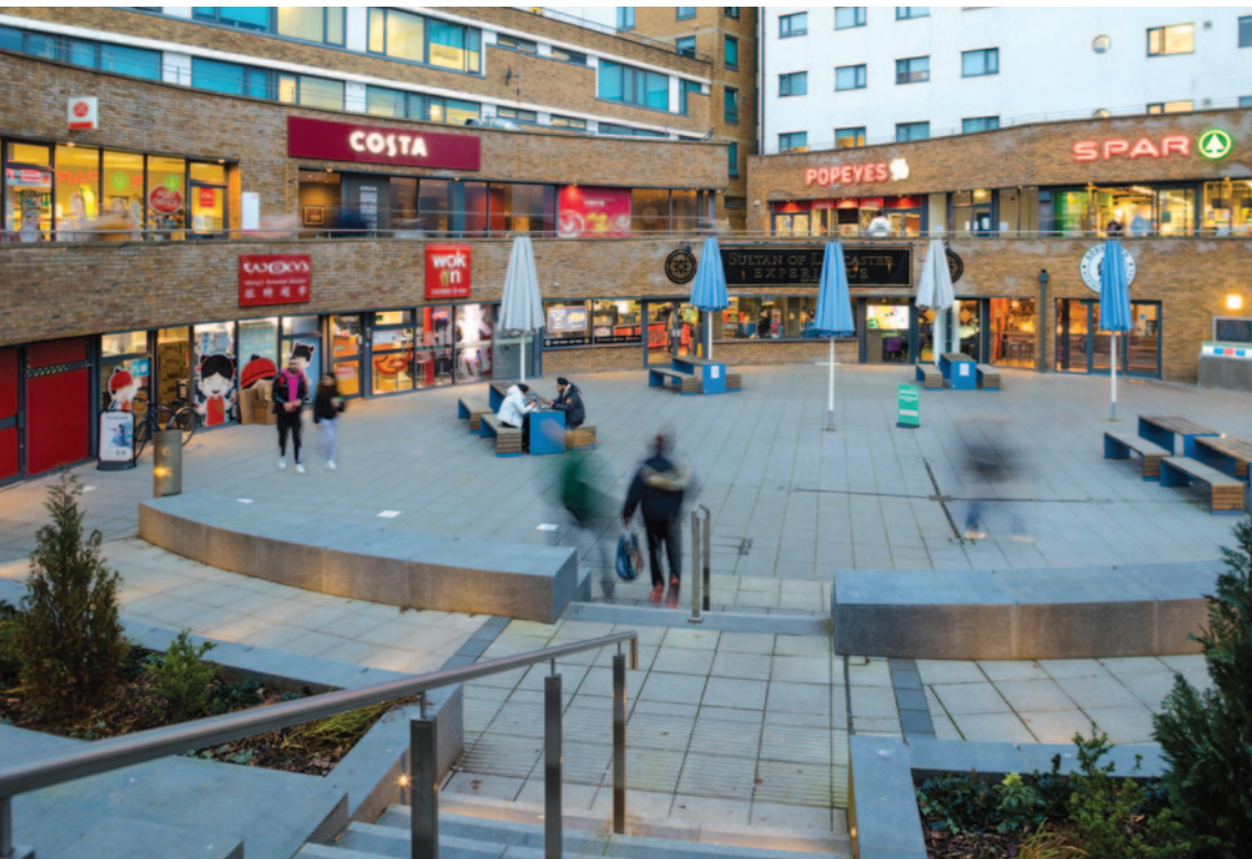
Edward Roberts Court

The launderettes are fantastic. There are loads and they're open for such long hours. Going to the launderette became part of my weekly routine and I ended up enjoying laundry!