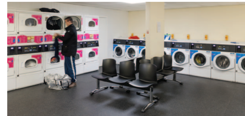
One of many launderettes on campus

As well as the things you want for a great time on campus, there's also everything you need to live comfortably. Launderettes, a post office, medical centre, pharmacy, hair salon, barbers and more means you don't have to travel far.