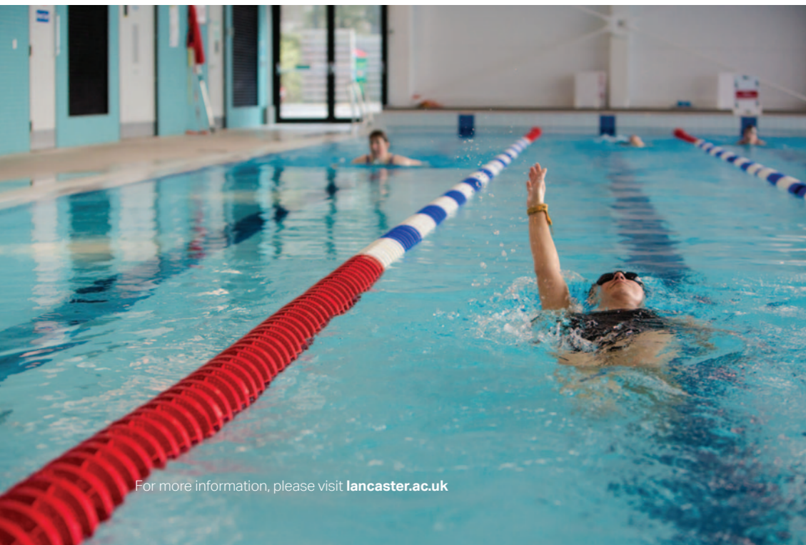
25m swimming pool

For more information, please visit lancaster.ac.uk