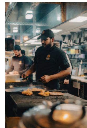
Sultan's of Lancaster